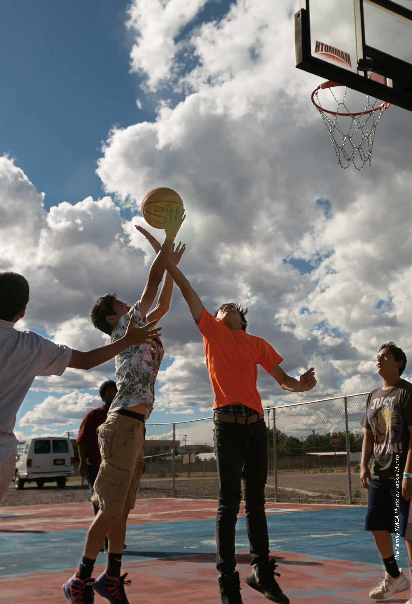
The Family YMCA